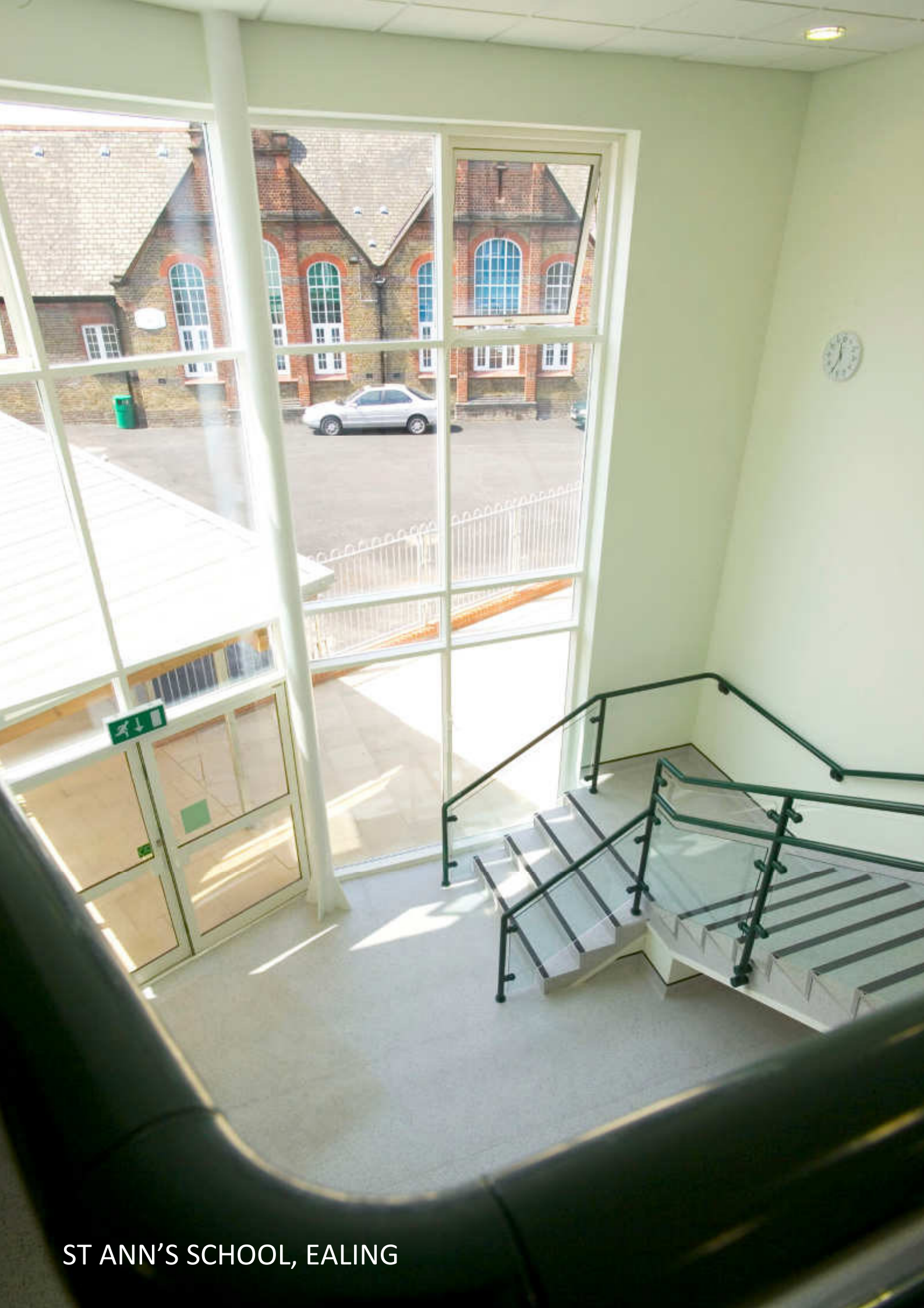
ST ANN'S SCHOOL, EALING