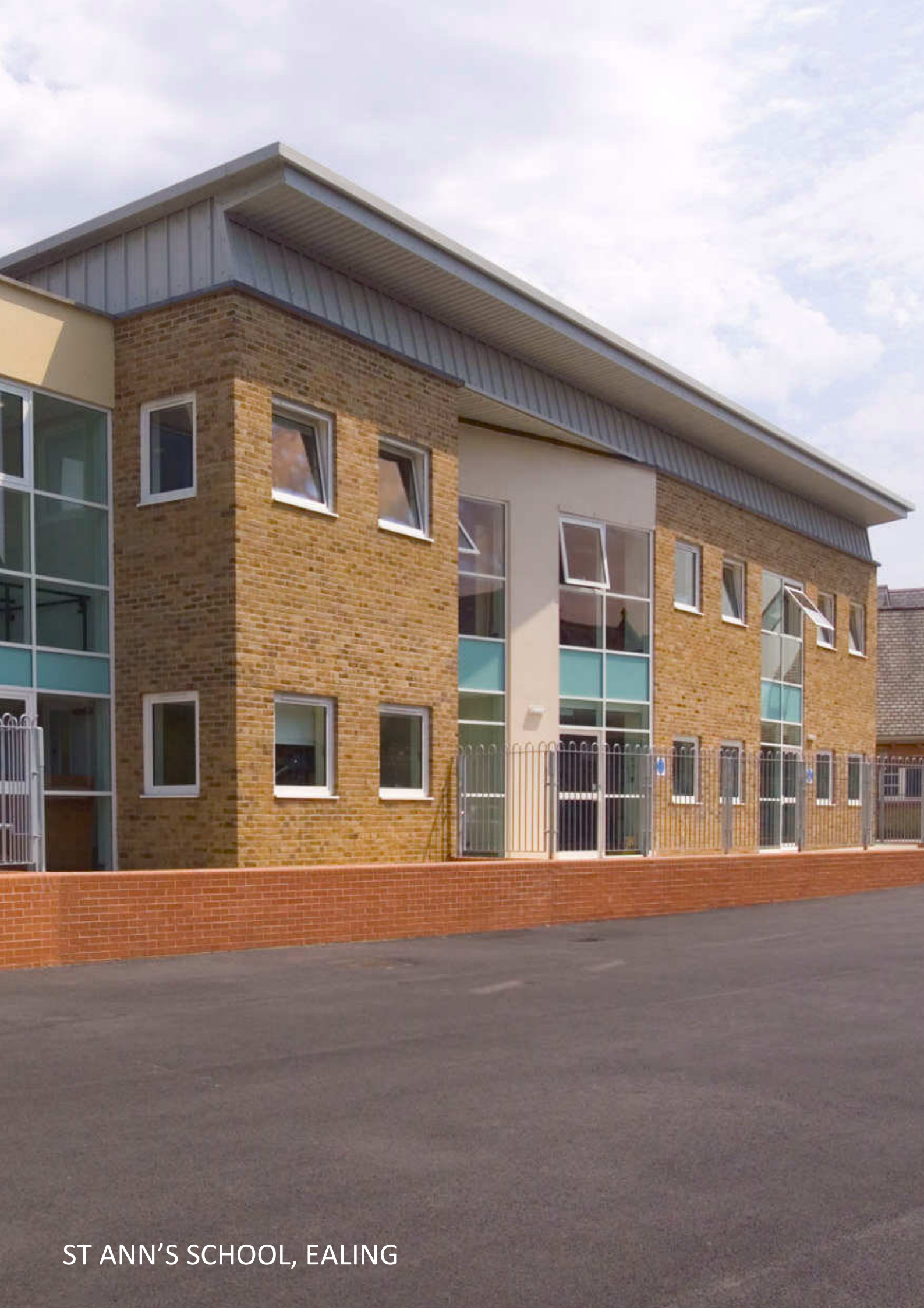
ST ANN'S SCHOOL, EALING