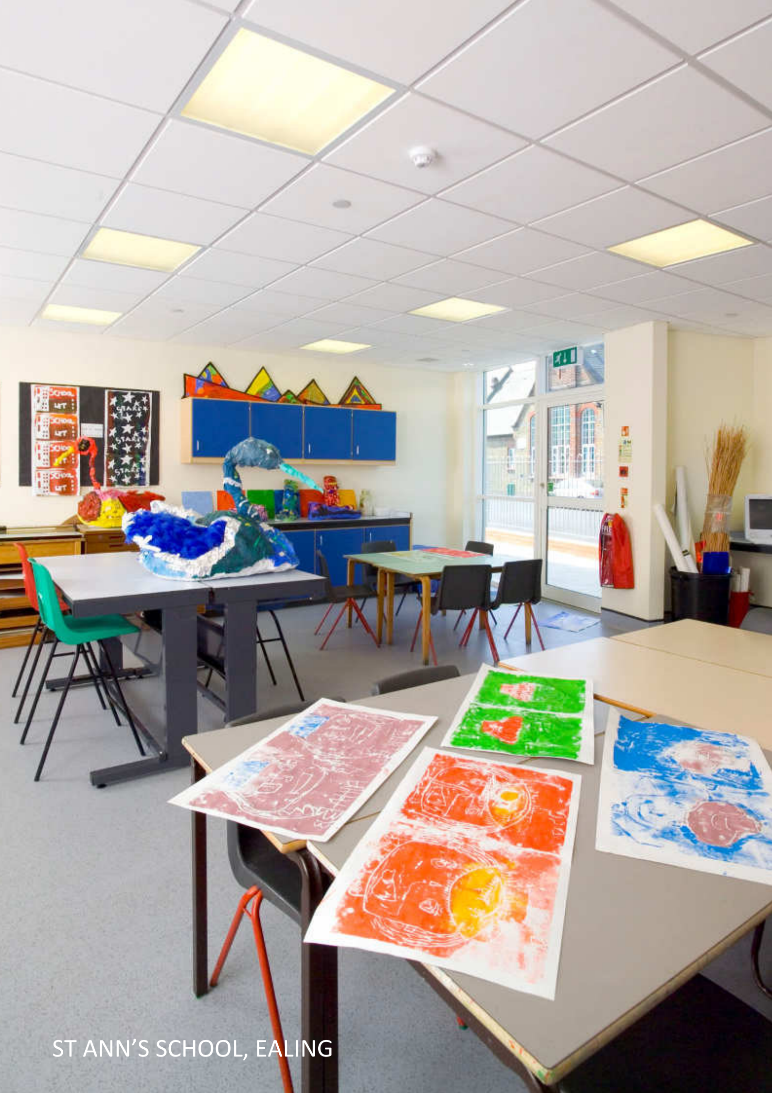
ST ANN'S SCHOOL, EALING