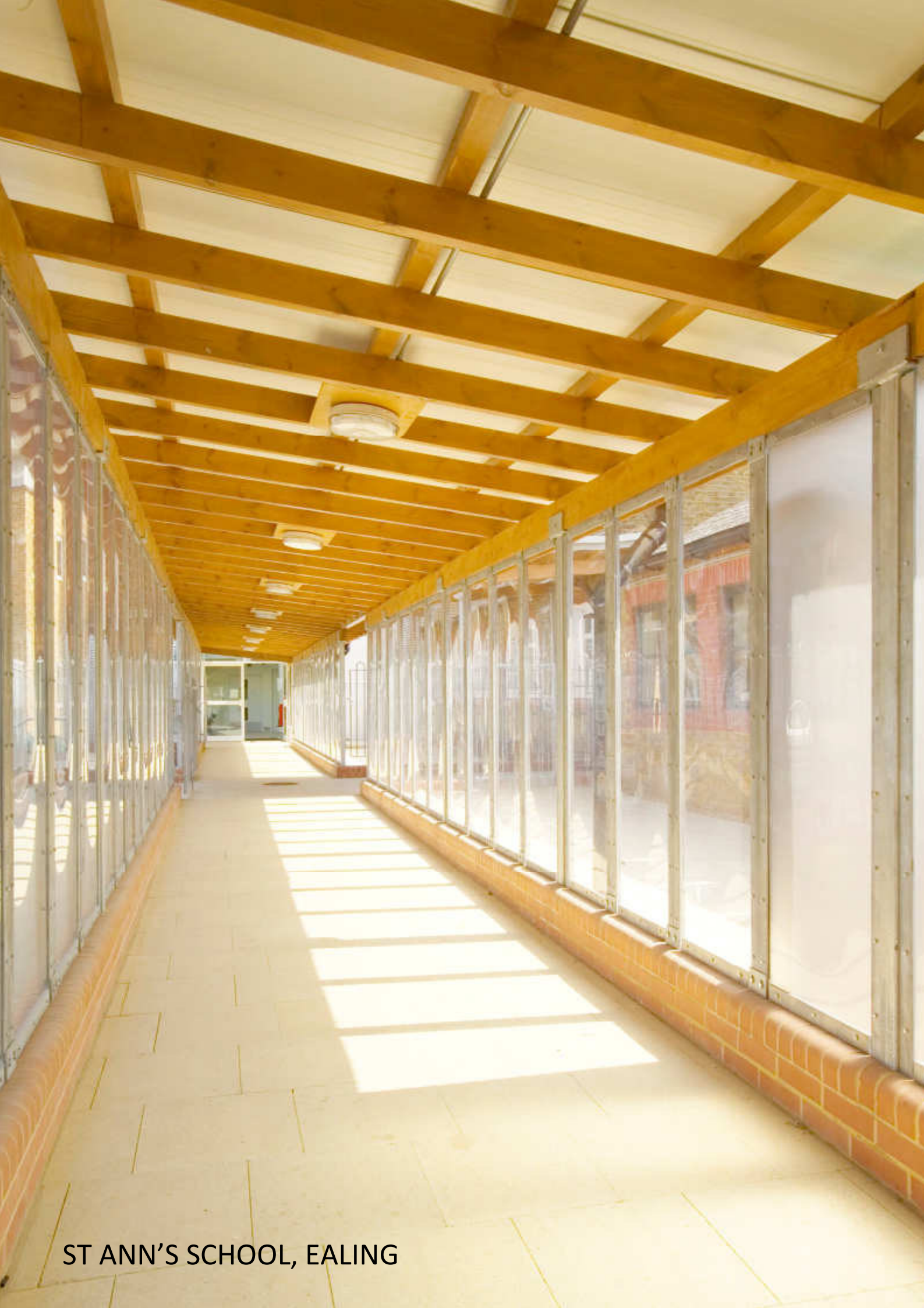
ST ANN'S SCHOOL, EALING