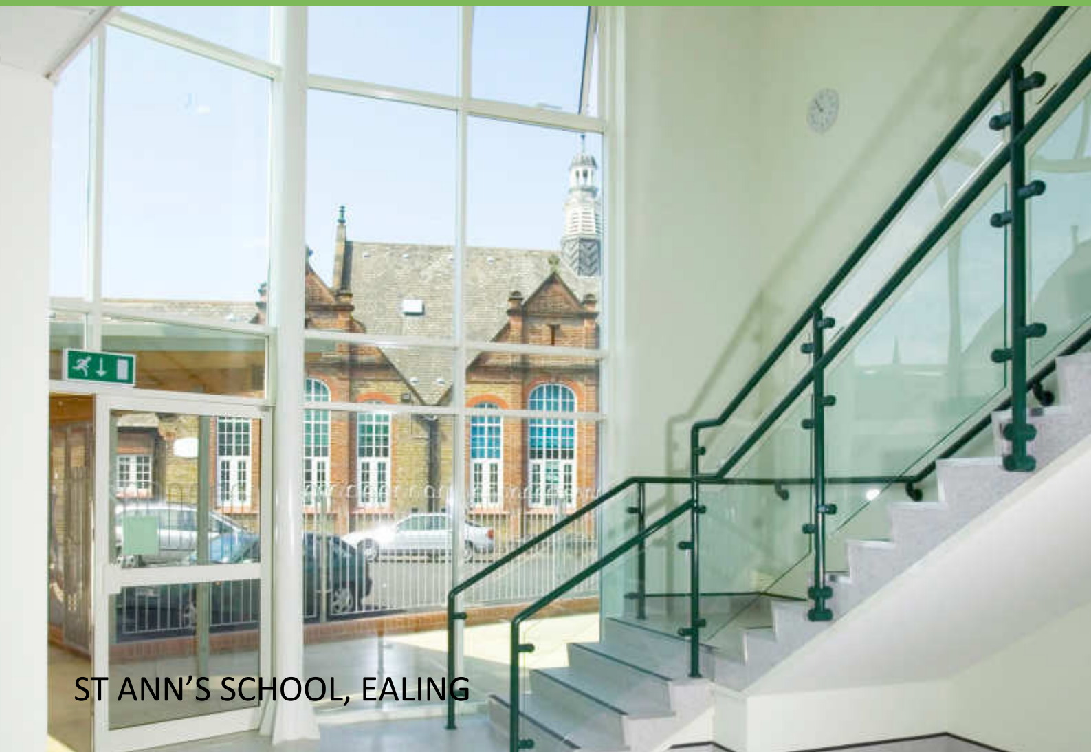
ST ANN'S SCHOOL, EALING