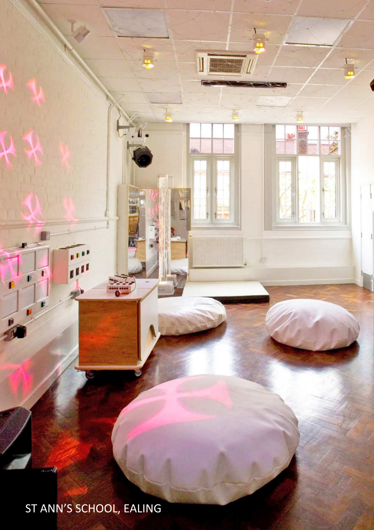
ST ANN'S SCHOOL, EALING